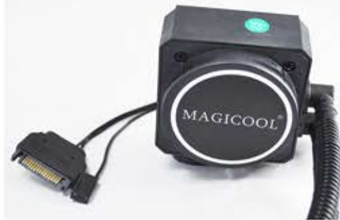
Pump integrated in CPU block with monitoring