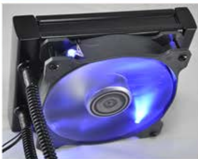
120 mm radiator with PWM LED fan