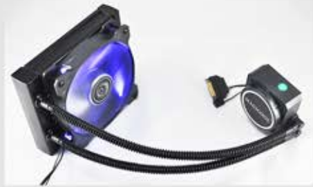
AiO liquid cooling kits with 120 mm radiator