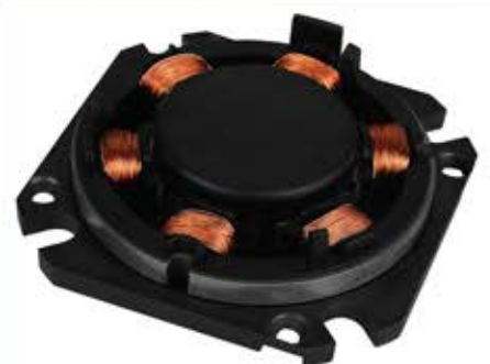
3 phase motor with ceramic bearing