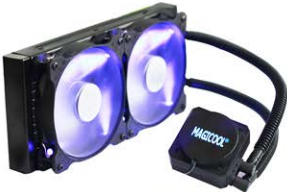
AiO liquid cooling kits with 240 mm radiator